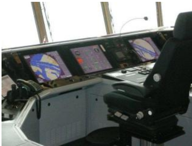
Modern navigation equipment

There is a seemingly endless stream of new technological innovations being developed and installed on board ships. Some arise from new regulatory requirements, such as for ballast water, harmful atmospheric emissions or safety requirements. Others are generated by research aimed at improving operational efficiency, saving money and, in theory, making life easier for seafarers.