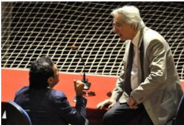
Captain Schettino with his lawyer in Grosseto

True is the fact that Captain Schettino has confronted the Italian legal system in a manner which could be called slightly tactless. In stead of awaiting the final trial in a modest manner giving answers only to correct questions, he choose to confront investigators and judges. During the hearings in Grosseto, he defended his case with ardour and mentioned his own endeavours and even God as factors which saved so many lives. Moreover he appeared in a number of international television