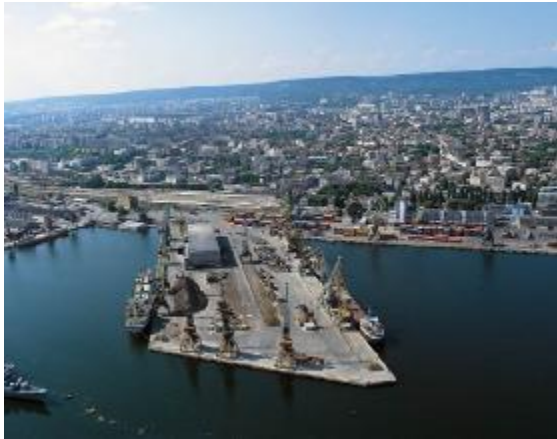
The Bulgarian port of Varna

The relationship between shipmaster and pilot has always been an interesting topic with a lot of variations in different countries, ports and nationalities. The basic rule is that the master is responsible for the navigation of the ship and that the pilot is an advisor to the master with limited responsibilities. This rule depends on different regulations in different countries and ports. However navigation has changed enormously during the last decades. More and more masters and officers on board ships rely completely on electronic equipment which is quite understandable.