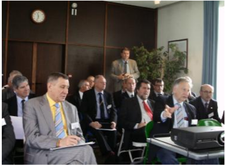
an attentive assembly

The seminar was followed by the Annual General Assembly in the afternoon. Discussed were the main items which return regularly in CESMA assemblies such as criminalisation of shipmasters. Attention is given to the case of the captain of the "Costa Concordia" who faces criminal indictment after several accusations by the Italian authorities as a consequence of the serious accident which caused 32 victims. At the request of the shipmasters' association USCLAC in Genoa, of which Captain Schettino is a member, CESMA will assist the lawyers in his defence to follow up whether justice is done.